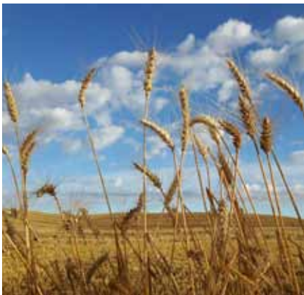
September: 'Cereal Grains at Harvest time' by Brenda Meyer