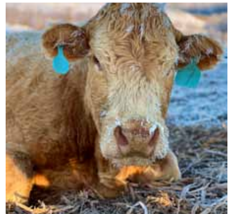
February: 'Frosty Snow' by Paige Jones

Copies of our 2024 County Calendar are still available for pick up at our County Admin Building, at 6602-44 Avenue, Stettler.