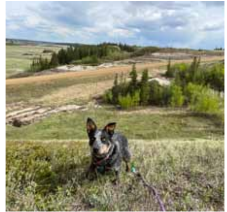
Front Cover: 'A view with my Partner' by Stacie Hunter