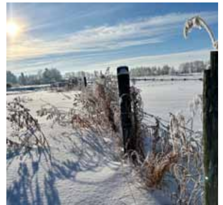
December: 'Frozen Warmth' by Tana Nixon