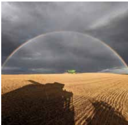
October: 'Combining near Boss Hill after the Rain' by Tyler Hassett