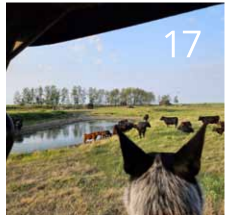
DUGOUT WORKSHOP WITH LYNNE MELVIN