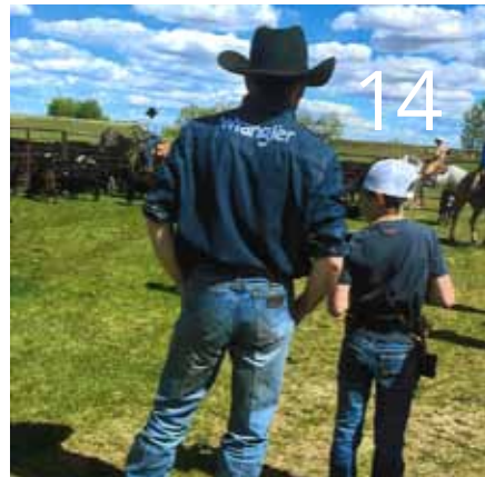
FINDING FAIRNESS IN FARM TRANSITIONS - WORKSHOP