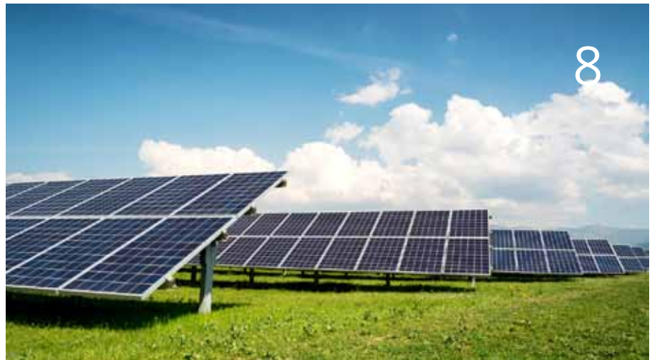
SOLAR POWER PLANTS AND THE COUNTY OF STETTLER