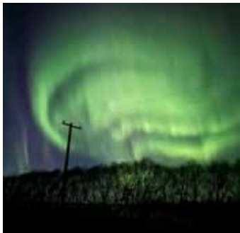
Honourable Mention: 'Amazing Northern Lights' by Kylar Cornelssen