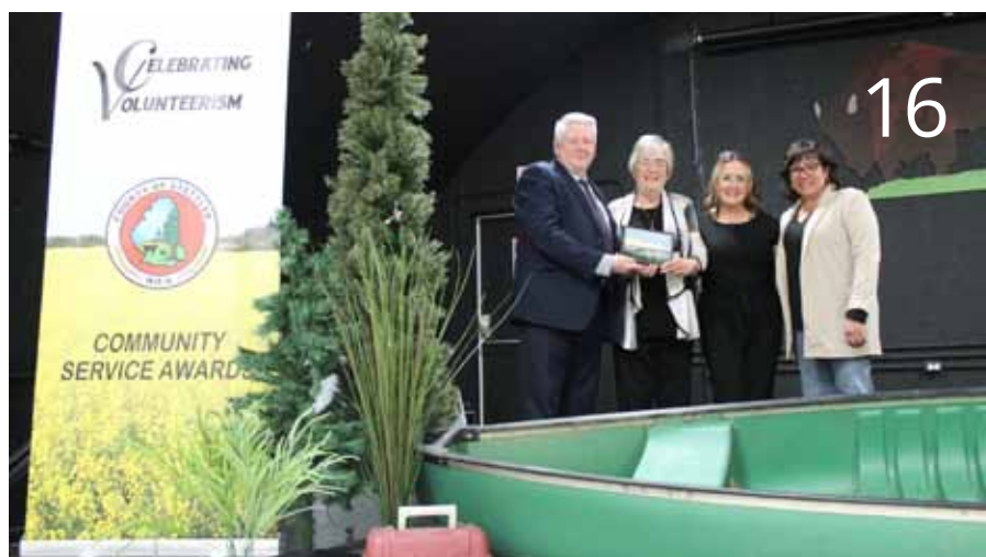
2024 COMMUNITY SERVICE AWARDS CELEBRATED IN ROCHON SANDS