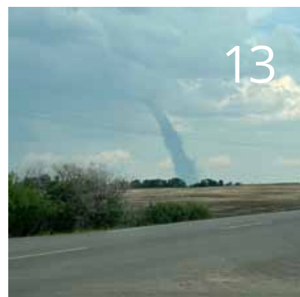
BE PREPARED FOR THE UNEXPECTED.