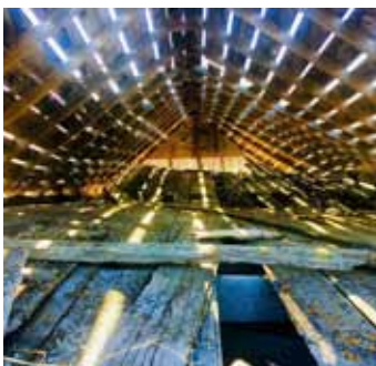
Honourable Mention: 'Barn roof' by Erin Bengert