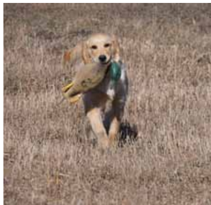
'Puppy in training' by George Harde