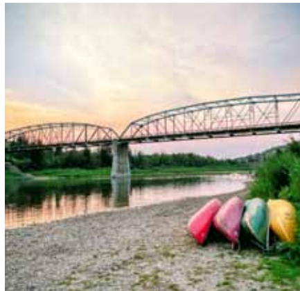
'Summertime is river time' by Tana Nixon