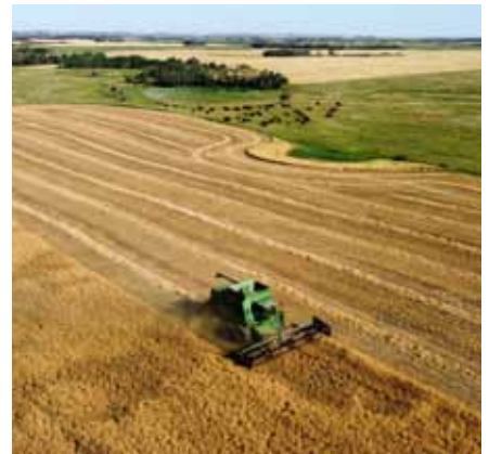
'Harvesting under the watchful eye of the cattle' by Annabel O'Dea