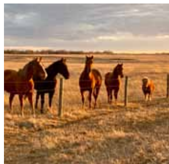
Honourable Mention: 'Family comes in all shapes and sizes' by Jane Skocdopole