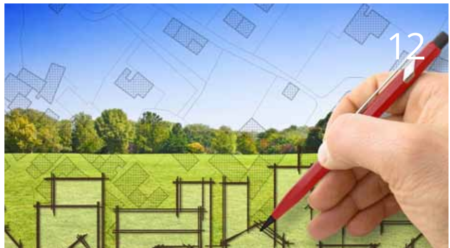
WE NEED YOUR INPUT - PLANNING FOR THE FUTURE.