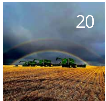
CELEBRATING OUR PHOTO CONTEST WINNERS