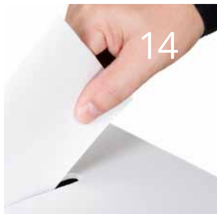
STETTLER COUNTY VOTES 2025