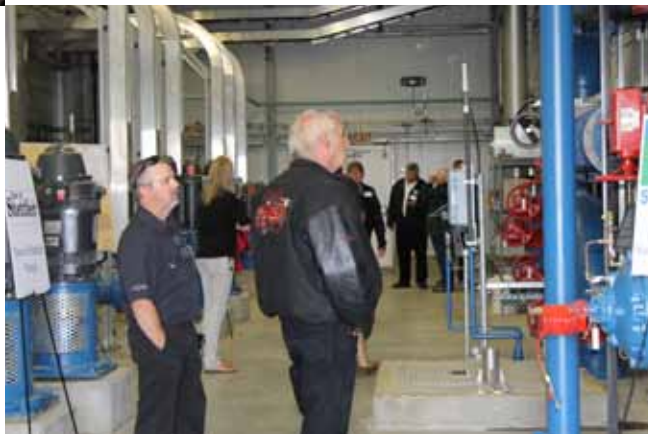
Touring the SMRWSC Water Transfer Site in Stettler.

16 municipalities (County of Stettler No. 6, Camrose County, Lacombe County, County of Paintearth, Special Areas Board, Town of Castor, Town of Coronation, Village of Bawlf, Village of Big Valley, Village of Consort, Village of Donalda, Village of Halkirk, Village of Rosalind, Village of Veteran, Summer Village of Rochon Sands, Summer Village of White Sands) whose objective is to supply potable water to its member communities. The Regional line heading east to the Village of Consort was Phase 1, Stettler to Big Valley was Phase 2, and Stettler to Donalda was Phase 3. Further plans for extending the line to South Buffalo Lake (Rochon Sands and White Sands) and further north to the County of Camrose, Village of Rosalind and Bawlf and the County of Camrose and County of Lacombe will occur when funding becomes available.