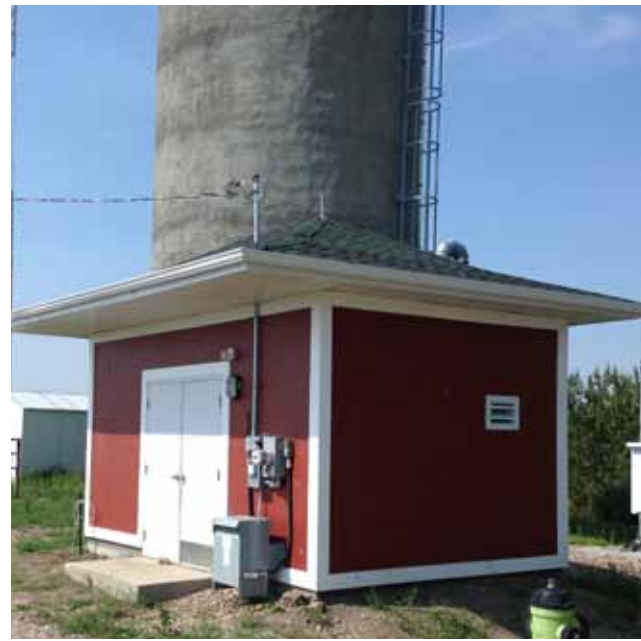
Big Valley Water Facility