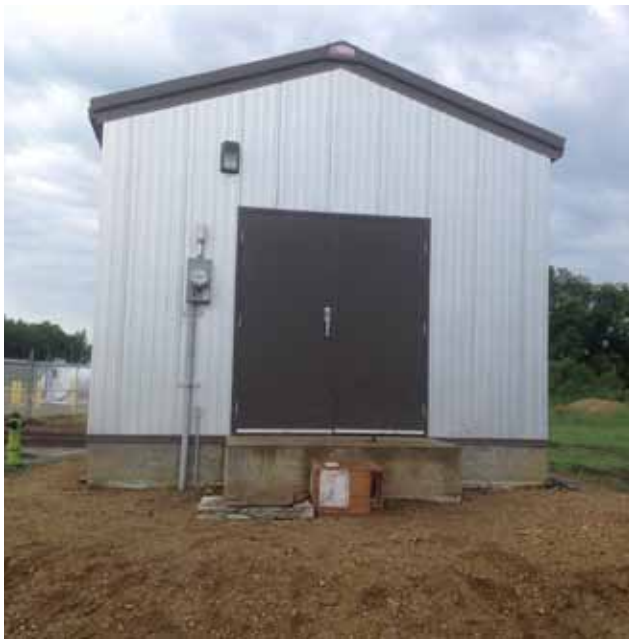
Donalda Water Facility