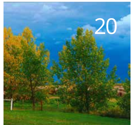
SOLAR POWER PLANTS AND THE COUNTY OF STETTLER