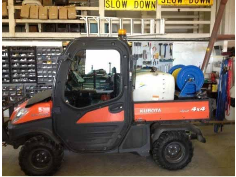
Side by Side Spray Truck