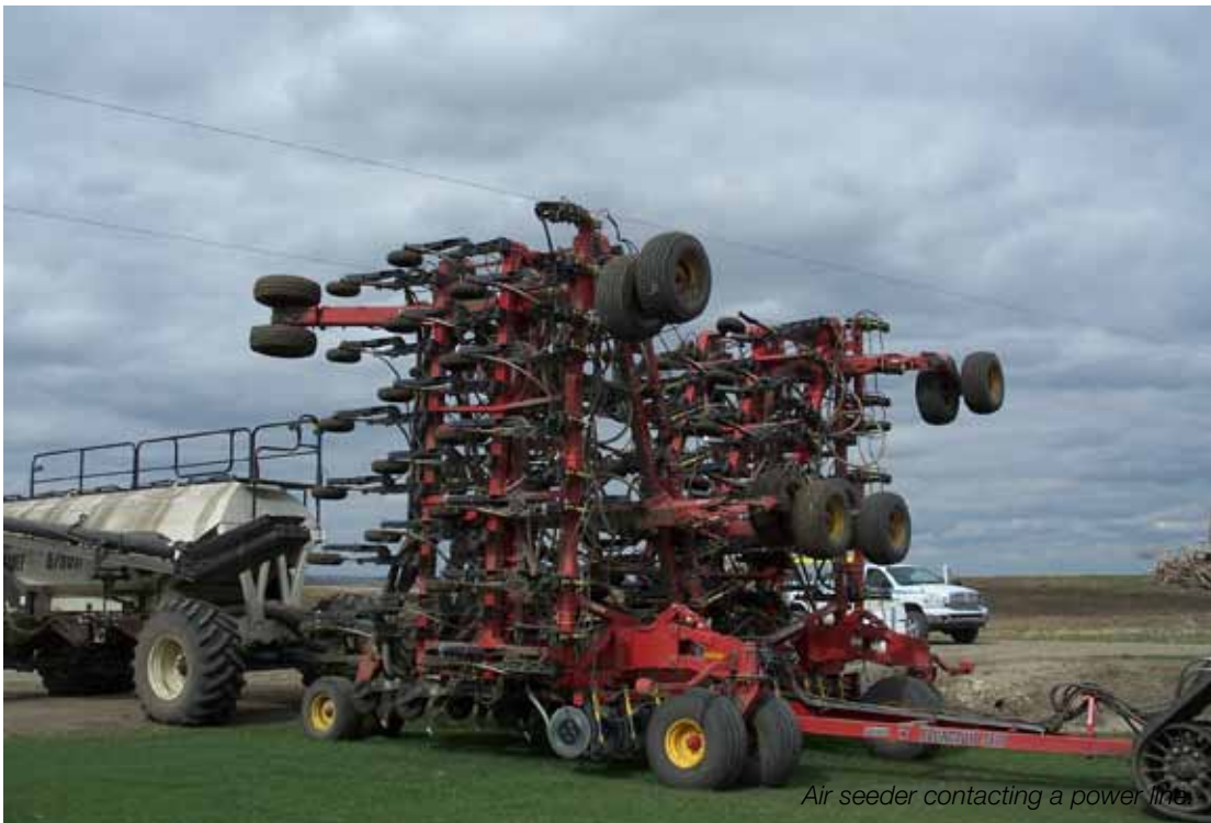
Air seeder contacting a power line