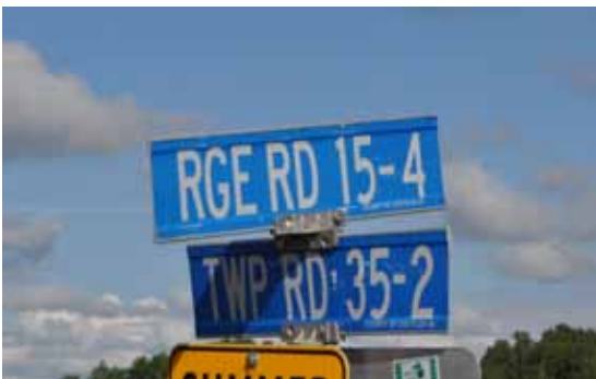
Intersection at Township 35-2 & RR 15-4