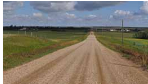
Hunting Lodge Road