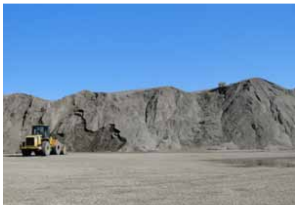
Stormoen Gravel Pit