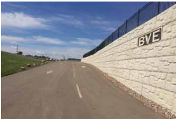
Buffalo View Estates

All of these major road construction projects, gravel purchases and special infrastructure projects were made possible through this grant funding.