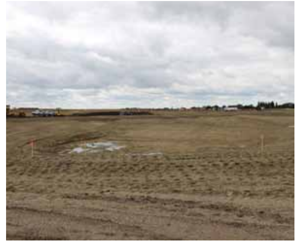
New Public Works Facility Site