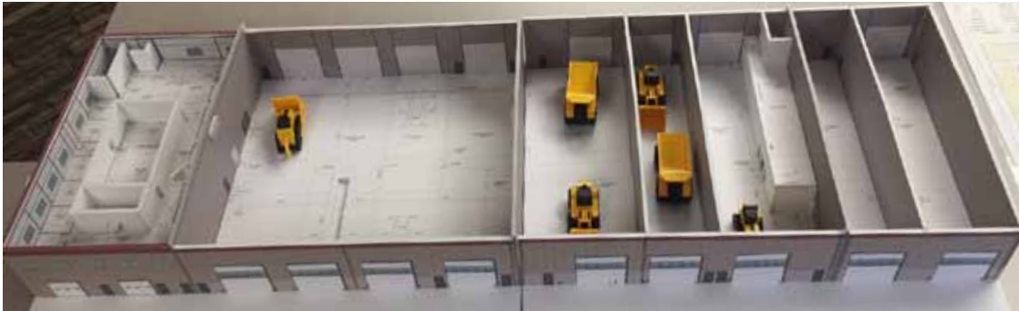
Model of the new Public Works Facility