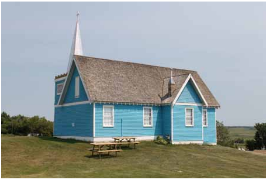
The County of Stettler participated in a Public Meeting to discuss intermunicipal development with Big Valley on November 27.