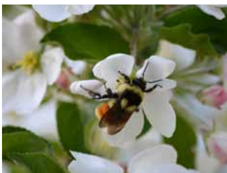
Bee Pollinating Apple Tree Heather Derrick