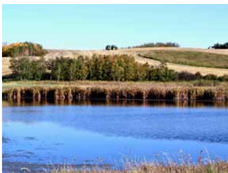
Fall Baling Elaine Partsch