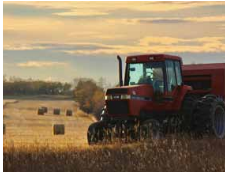
Sunset Hay Kami Ritz