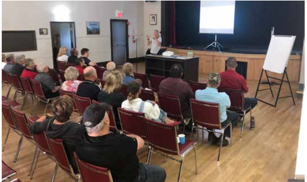
Talking 'Cannabis' at the Botha Community Hall.