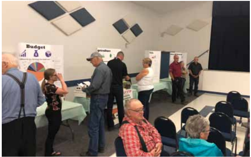
Collecting feedback for our budget survey at the spring 2018 Open House in Byemoor, AB.