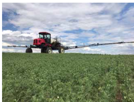
Spraying Junae Ventnor