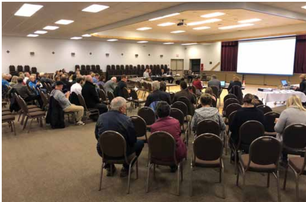
The Subdivision Development and Appeal Board Hearing for Paradise Shores Development Permit 18001.

The SDAB agreed with the Appellants that the density of the proposed development was not consistent with the applicable density policies of the applicable Intermunicipal Development Plans and determined the proposed Development is subject to the density provisions for lands within the 'Small Lot Area' at 1.97 dwelling units per acre prescribed in the Buffalo Lake South Shore Intermunicipal Development Plan.