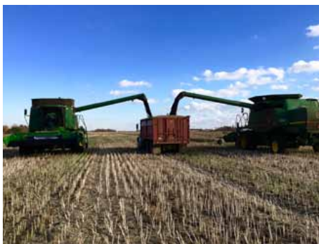
Canola Harvest Cathie Erichsen Arychuk