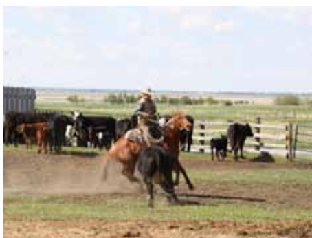
Ranch Cutting Work Megan Wills