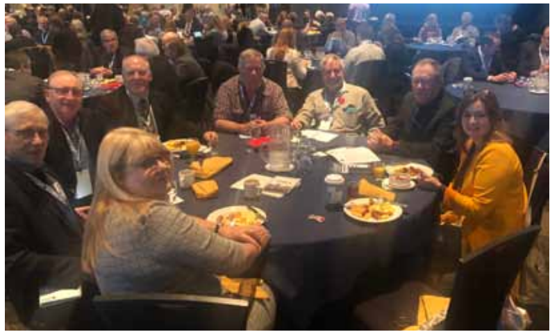
Council and Administration gathering for the Rural Municipalities of Alberta Fall Conference.