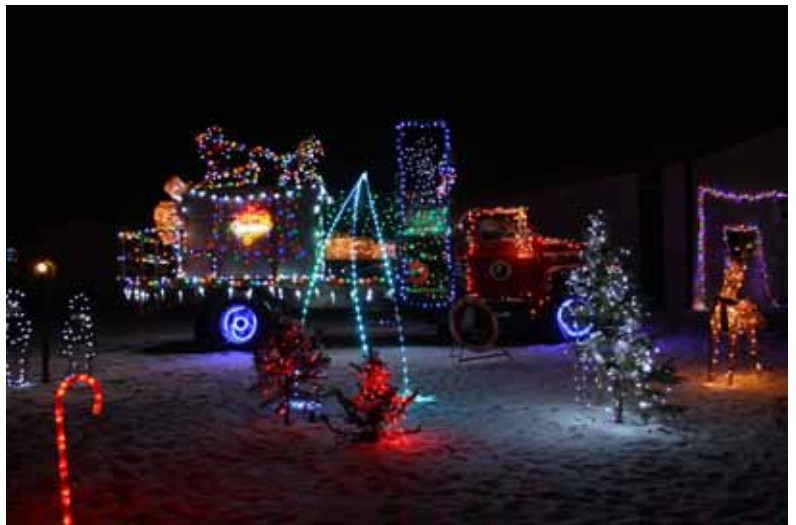
The County's display at the 2019 'Light the Night'.