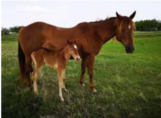
Our Cohorts