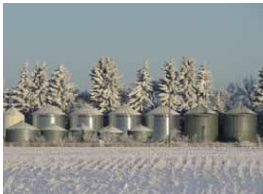
Frosty Day in January