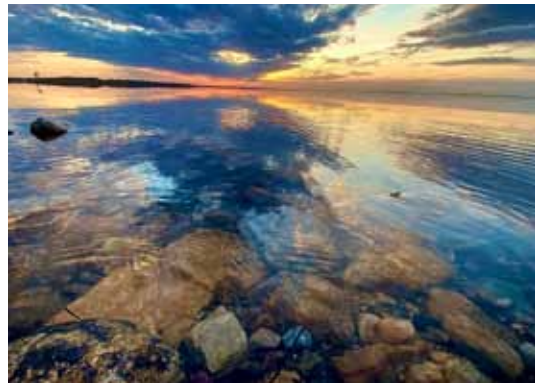
May Long Weekend