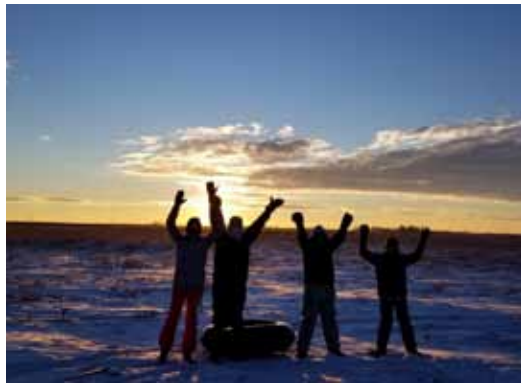
Tubing Submitted by Christel Shuckburgh