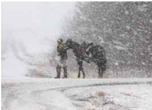
You are not alone. Submitted by Karyn Tateson