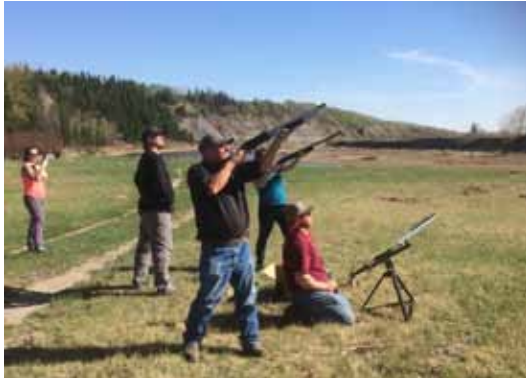
Skeet Shooting Submitted by Tammy Peterson