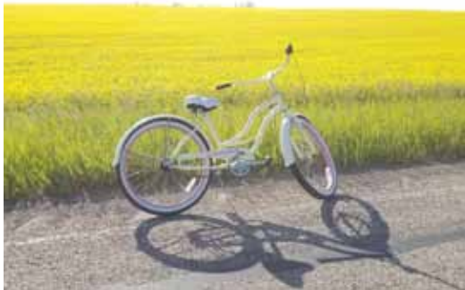
Country roads, take me home.