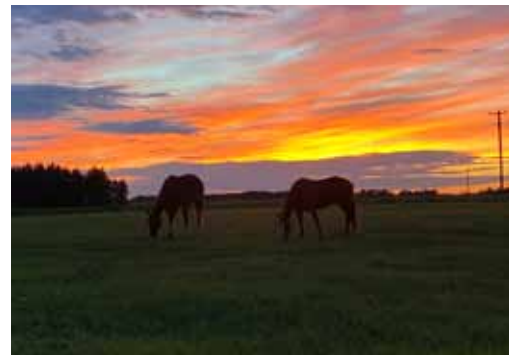
taken in Ward 4, Erskine South-Warden.