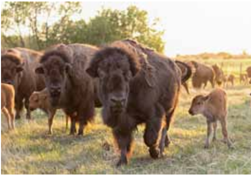
taken in Ward 3, Botha-Gadsby.