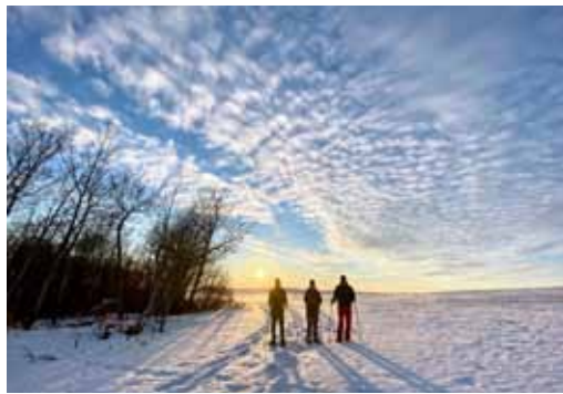
taken in Ward 5, Stettler.