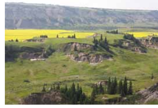
taken in Ward 2, Big Valley.