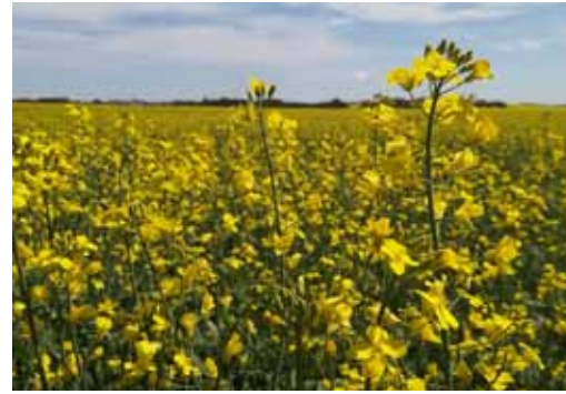
taken in Ward 1, Byemoor-Endiang.