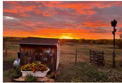
taken in Ward 3, Botha-Gadsby.