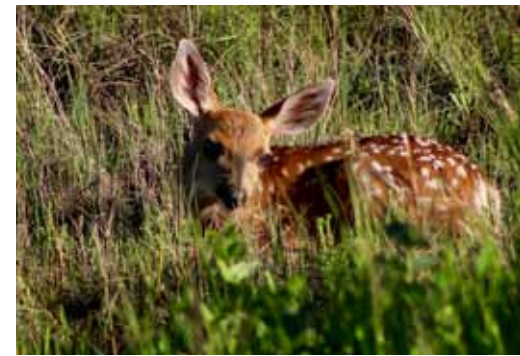
taken in Ward 7, Red Willow-Donalda.