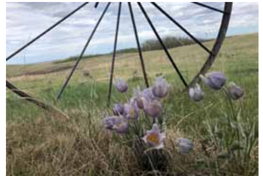
taken in Ward 1, Byemoor/Endiang.