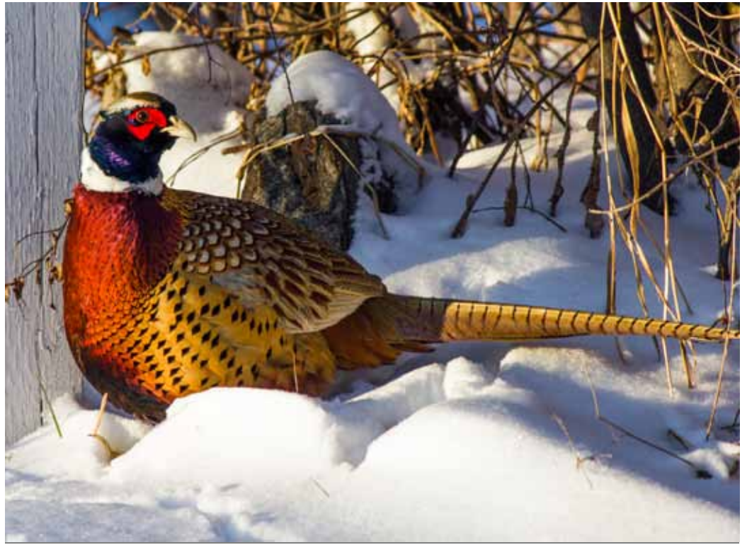
Grand Prize Winner: Glenn Munden - Photo taken in Ward 6: Erskine-Buffalo Lake