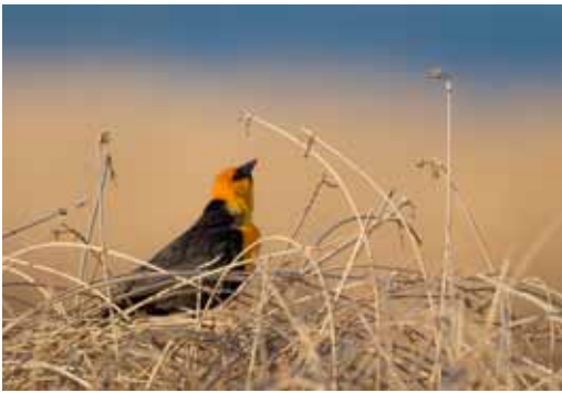
taken in Ward 6, Erskine-Buffalo Lake.