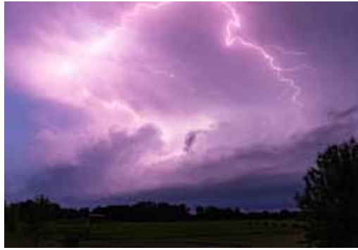
taken in Ward 4, Erskine South-Warden.