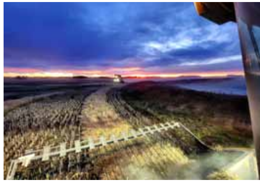
taken in Ward 5, Stettler.