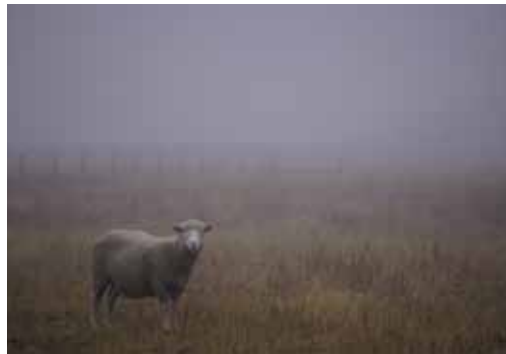
taken in Ward 2, Big Valley.