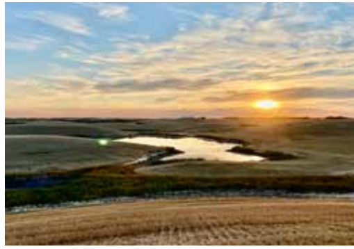
taken in Ward 7, Red Willow-Donalda.